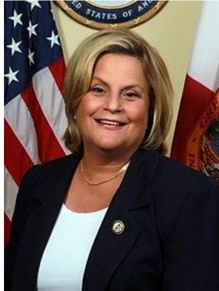
Honorable Ileana Ros-Lehtinen United States Representative

I am proud to represent Florida's 27th Congressional District, a diverse area which includes Coral Gables, Cutler Bay, Key Biscayne, Little Havana, Miami, Miami Beach, Pinecrest, South Miami, and Westchester.